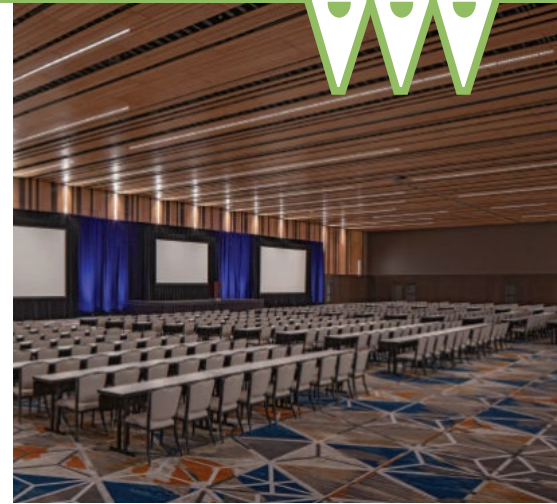
Hyatt Regency Seattle Columbia Ballroom Level 3 (see map page 7)